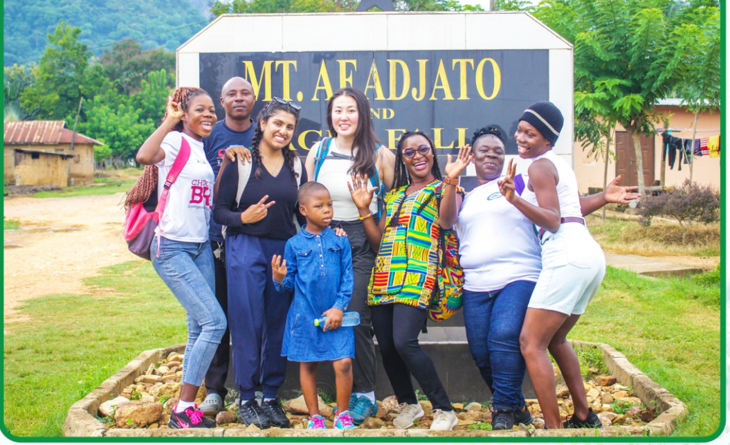
Come experience Ghanaian hospitality, arts and culture